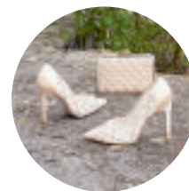
Ballgown shoe, £175, Believe bag, £80, at Dune London

Add a touch of magic to that walk down the aisle with a pair of dazzling heels. Dune has unveiled a beautiful 20-piece ivory satin footwear collection and an exclusive range of matching clutch bags. There's devil in the detail with bespoke embellishments including elaborate jewel trims, sparkling diamante-encrusted stars, intricate pavé charm heels and ribbon ankle ties adorned with pearl clusters. Even better, you don't have to suffer for fashion, each style created with latex and memory foam sock linings, cushioning the foot for added support and balance. There's even an elegant stone discreetly placed on each shoe sole, ensuring the bride's 'something blue' is ticked off. Adding a final flourish, the clutch bags are drenched in ornate pearls and gems, with showstoppers including a crystal kiss lock satin pouch, a jewel adorned wallet with mirror interior and a floral diamante-encrusted hardcase clutch.