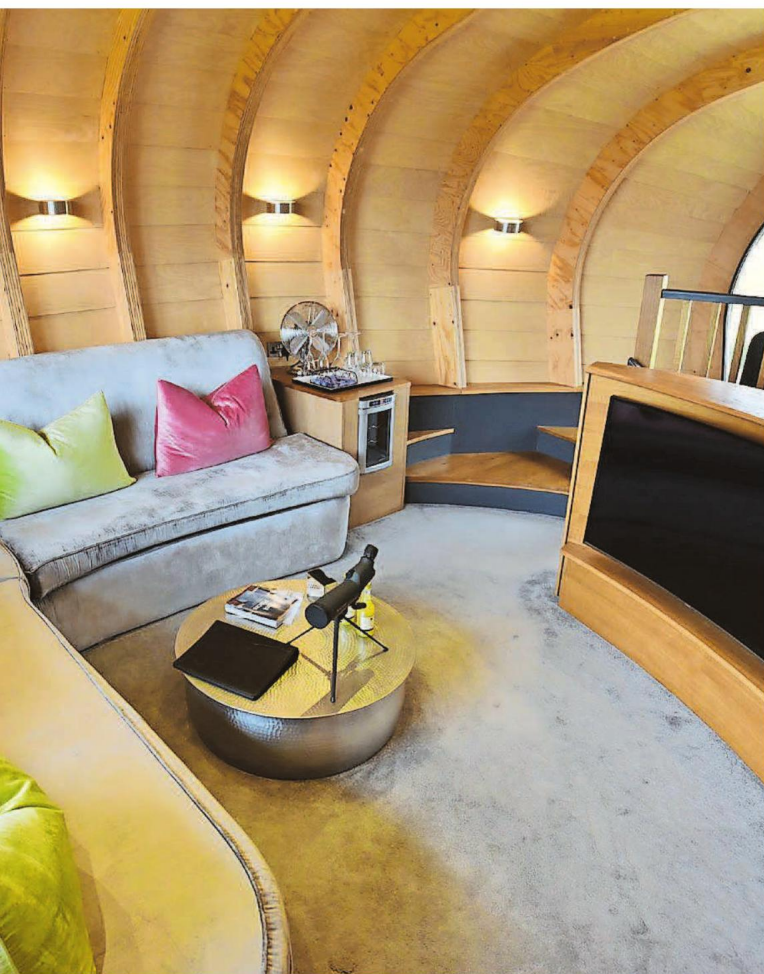
The Windmill Suffolk in Cockfield