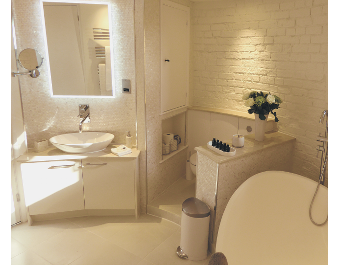
Exposed brickwork in the bathroom adds to the unique charm.

Steve, 42, a quantity surveyor, masterminded the building work while Natalie, also 42, and with a background in recruitment and training, looked after the interior finishes. Both are delighted with the finished article.