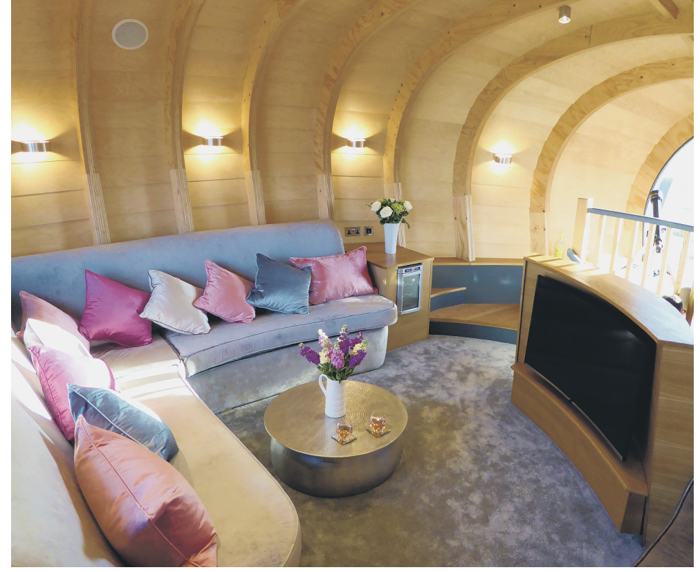
Steve and Natalie are most proud with the 'pod' at the very top of the structure.

More details can be found via www.thewindmillsuffolk.com