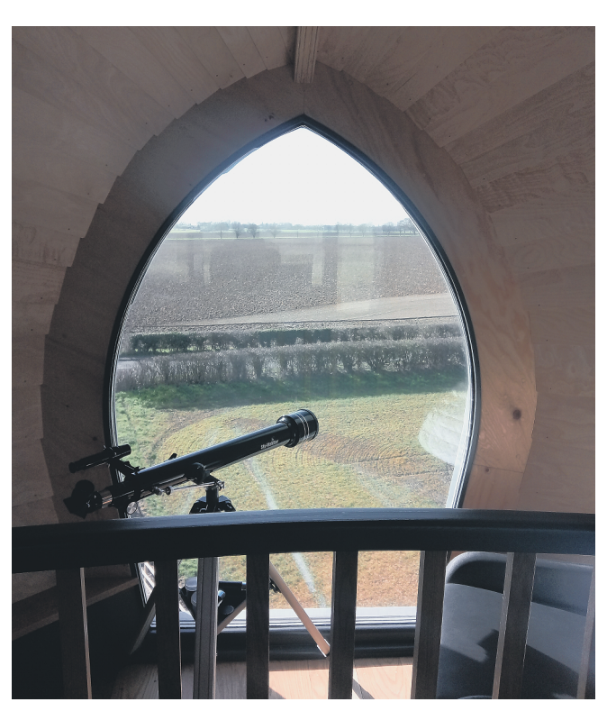
Views from the top take you out across the Suffolk fields