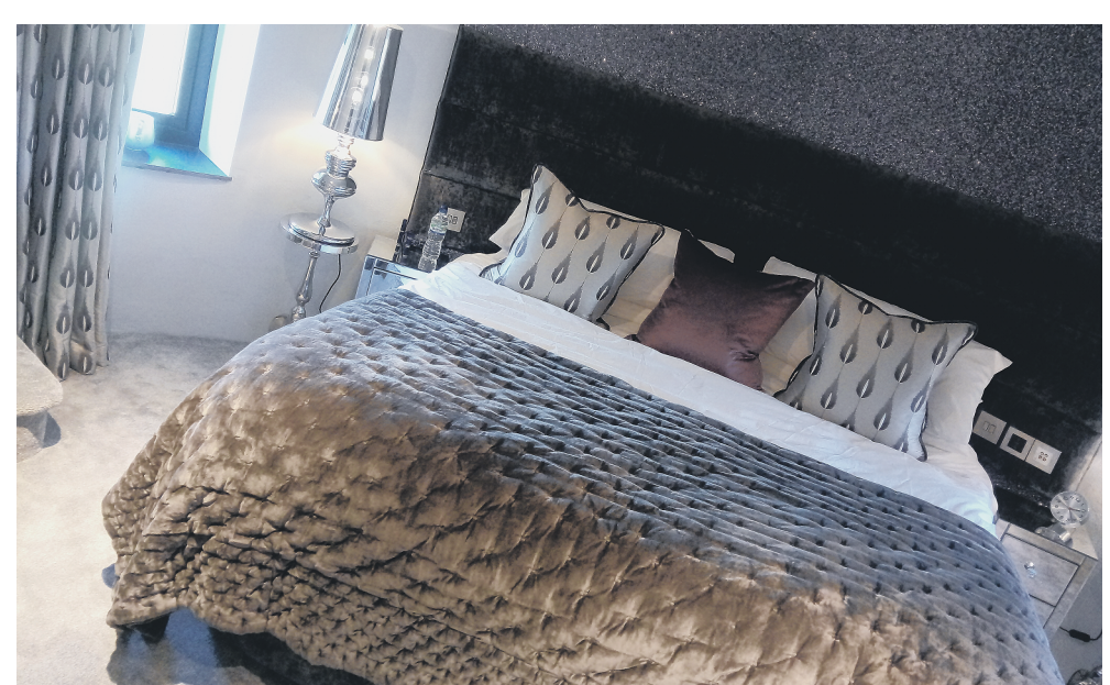
The accommodation has been furnished to a high standard for guests.